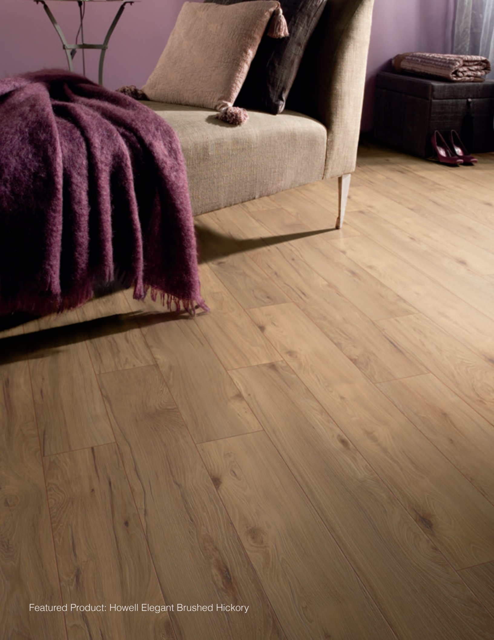
Featured Product: Howell Elegant Brushed Hickory